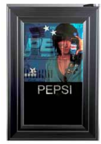
TV screen fridge with wifi connectivity